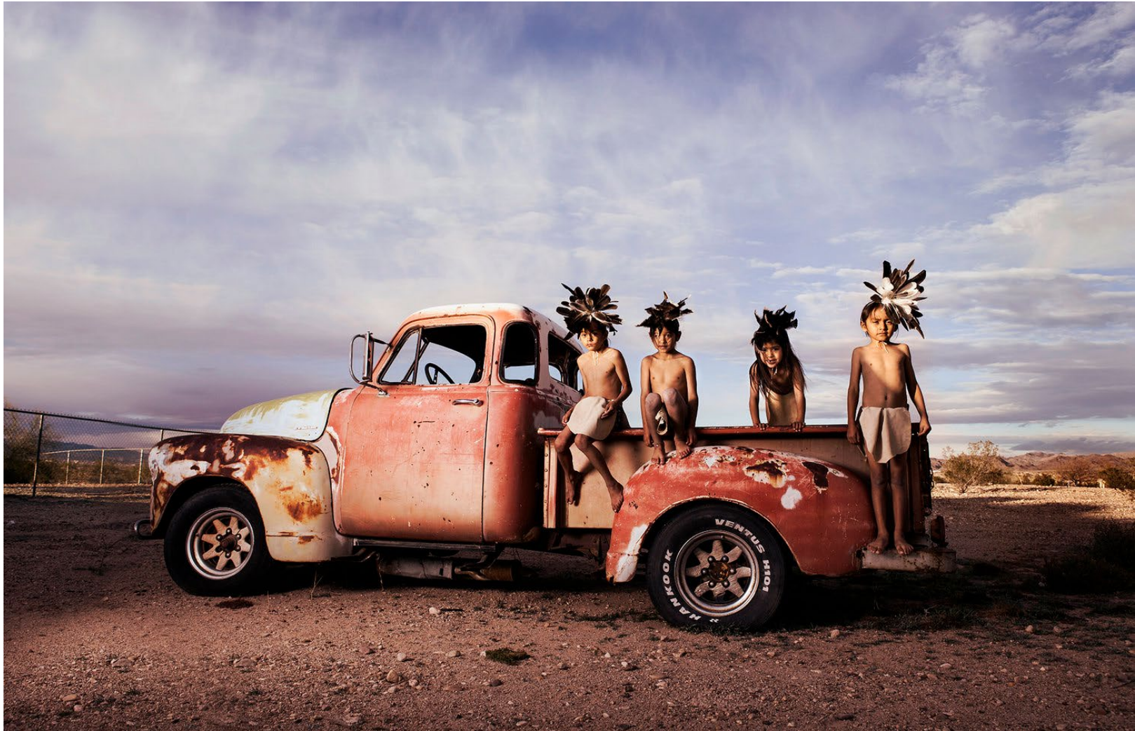
Spirits of Siwavaats , 2019 archival pigment photograph 23 x 36 inches, edition of 15: $4,500 Available framed: $6,000