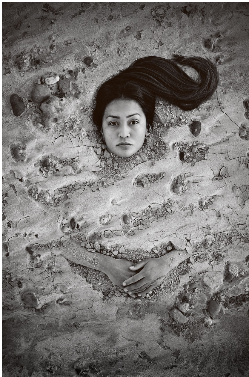
Sand and Stone , 2020 archival pigment photograph 44 3/4 x 30 inches, edition of 7: $4,500 Available framed: $6,000