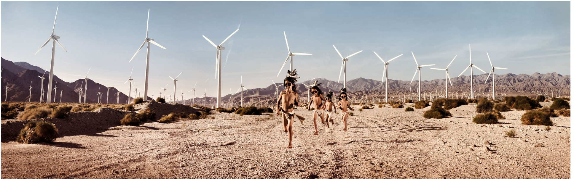
Evolvers , 2019 archival pigment photograph 19 x 61 inches, edition of 10: $10,000 Available framed: $11,500